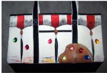
Big Top Tote